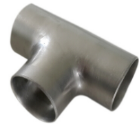
Table 7 Dimensions of Straight Tees and Crosses