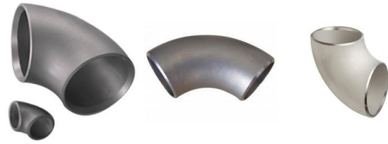
Table 1 Dimensions of Long Radius Elbows